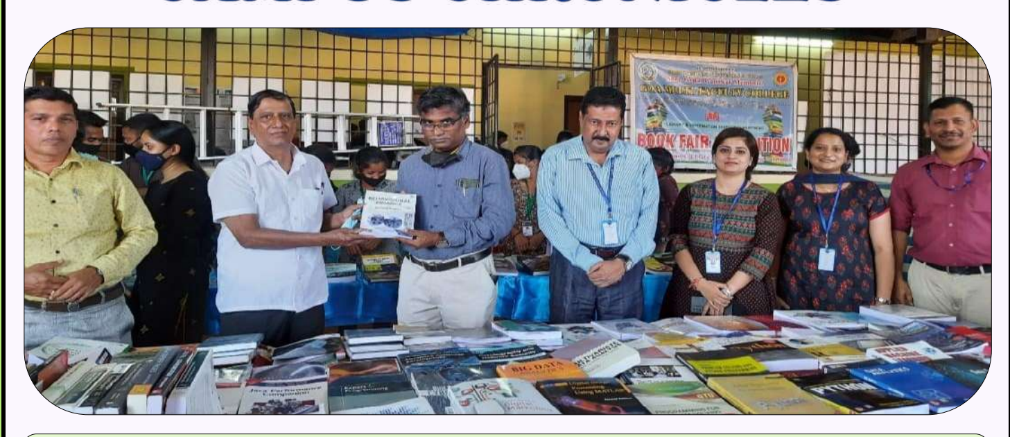
On 3<sup>rd</sup> & 4<sup>th</sup> March 2022, the Department of Library and Information Science in association with Bookmate Distributors organized a book exhibition-cum-sale in the college premises.