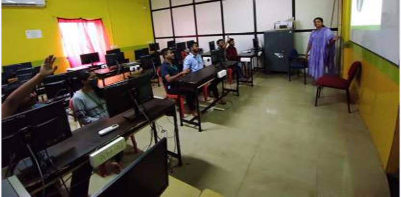
From 21<sup>st</sup> to 26<sup>th</sup> March 2022, the Department of IT and Computer Applications organized a series of Inter-Class competitions. The Mega Finale of all these activities was held on 9<sup>th</sup> April 2022.