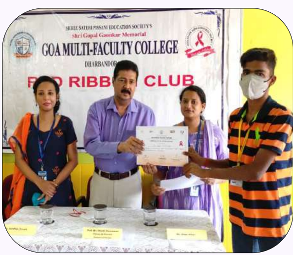
On 16<sup>th</sup> March 2022, the Red Ribbon Club organized the annual Prize & Certificate Distribution ceremony.